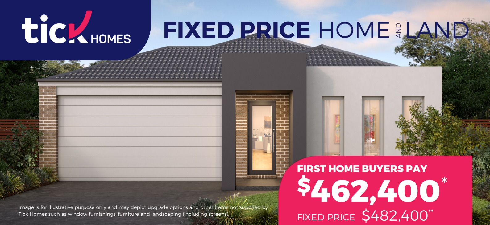
Image is for illustrative purpose only and may depict upgrade options and other items not supplied by Tick Homes such as window furnishings, furniture and landscaping (including screens).