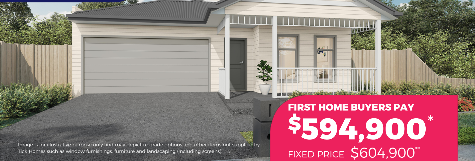
Image is for illustrative purpose only and may depict upgrade options and other items not supplied by Tick Homes such as window furnishings, furniture and landscaping (including screens).