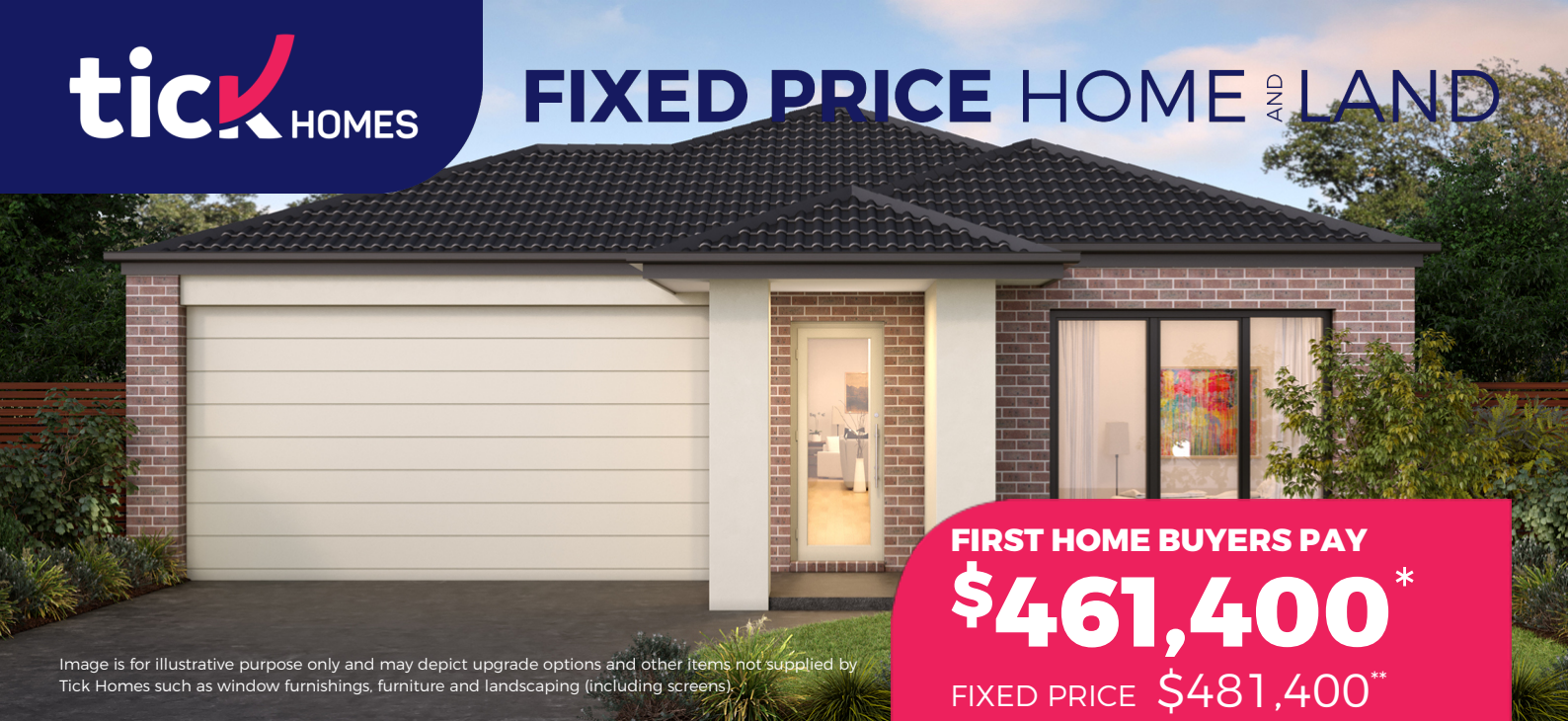
Image is for illustrative purpose only and may depict upgrade options and other items not supplied by Tick Homes such as window furnishings, furniture and landscaping (including screens).