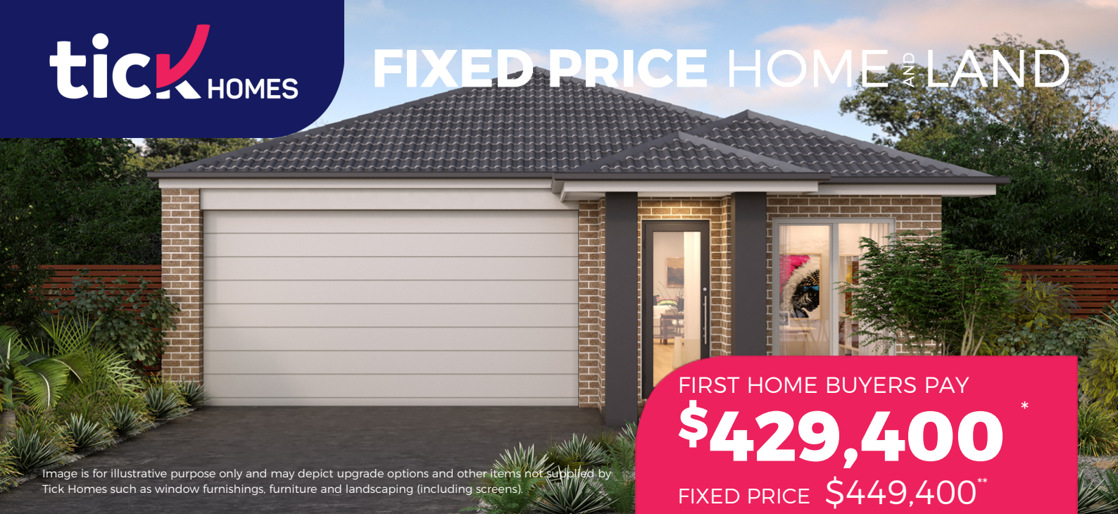
Image is for illustrative purpose only and may depict upgrade options and other items not supplied by Tick Homes such as window furnishings, furniture and landscaping (including screens).